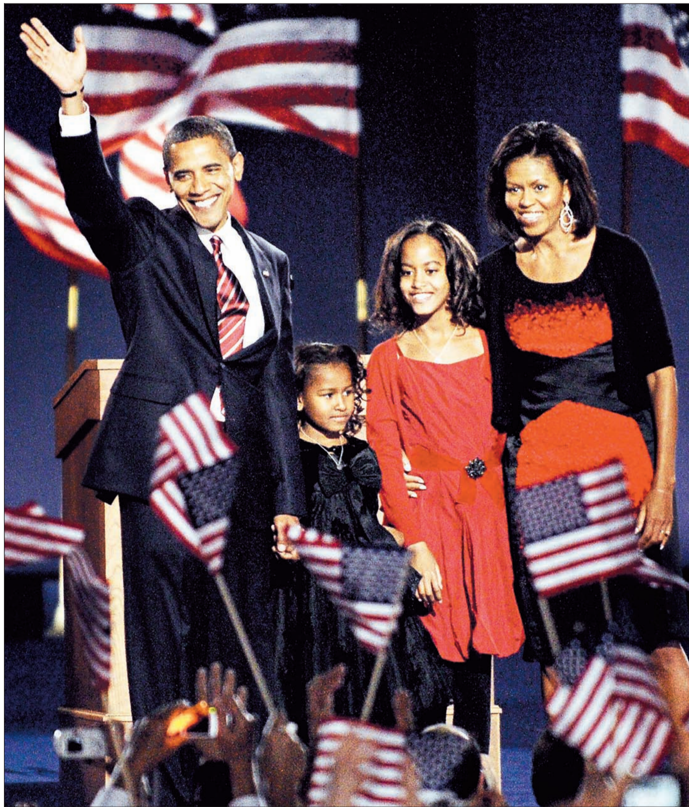
'CHANGE HAS COME': President-elect Barack Obama celebrates with his wife, Michelle, their daughters, Sasha and Malia, and more than 240,000 supporters gathered along Chicago's waterfront. Many wept at the landmark moment.

The first black president-elect wins a solid mandate and a fortified Democratic majority in Congress.