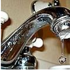
Fix A Leaky Faucet

Leaky faucets can drive a person mad, however I have good news, repairing a leaky faucet doesn't take a rocket scientist nor does it take an advanced degree in hydrology.